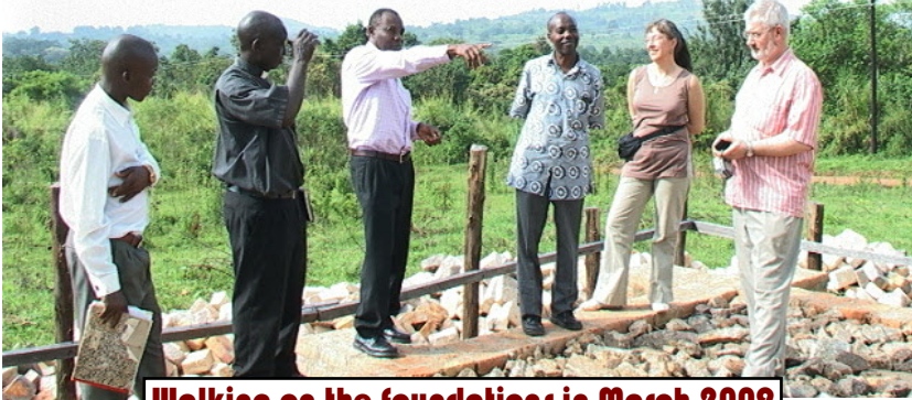
Walking on the foundations in March 2009

One of the biggest differences between Children growing up in Africa and in the UK is the education they can expect to receive.