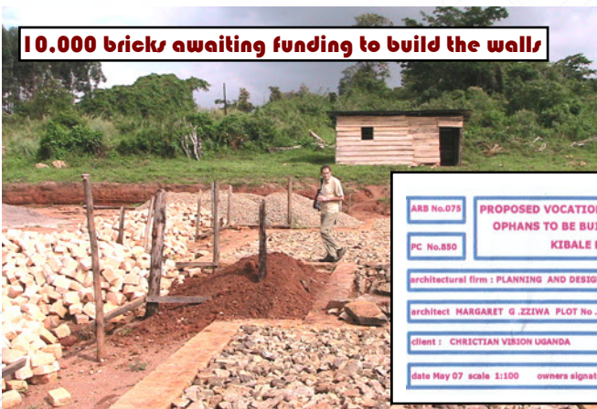
10,000 bricks awaiting funding to build the walls

We want to help CVU finance the construction phase, then, as funds allow, we will further assist by sending a container of equipment to Kibaale from our warehouse.