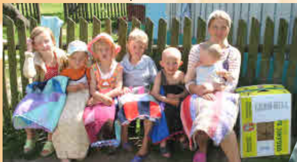
Orphans receiving your beautifully knitted goods

Over the past 7 months we have been sending the bulk of our beautifully knitted blankets and children's clothing to Eastern Europe rather than to Africa. Working with our partners, Mission Without Borders, we have been able to distribute these much needed items much quicker than we could have done previously by container to Africa.