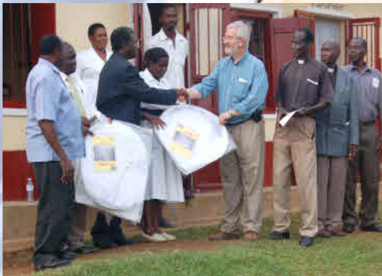
Handing over the first of many nets to the pastor and nurses at the Kimwanyi Health Centre near Kijjibwemi, Uganda.