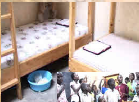
Orphans dancing for us during our evening of worship