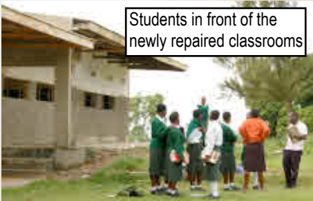
Students in front of the newly repaired classrooms

It would be good to finish off this project before our container full of school equipment (desks, pens, paper, school and library books, bicycles, sports equipment, etc.) arrives some early summer.