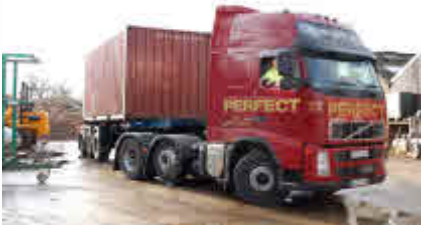
Empty Container being delivered (free of charge) to our warehouse to be filled with goods for Uganda

Work has started on filling the Ugandan Container destined for the Kijjabwemi Orphans Centre. The goods required carry an educational emphasis with stationery, reading books and computers in great demand. We are ordering specially refurbished desk top computer packages from a UK charity costing £50 each but we would also like to send laptops. Please contact the office if you are able to help. We hope that churches or other groups might like to raise the funds to buy one of the computer packages. Again speak to us if you would like to get involved.