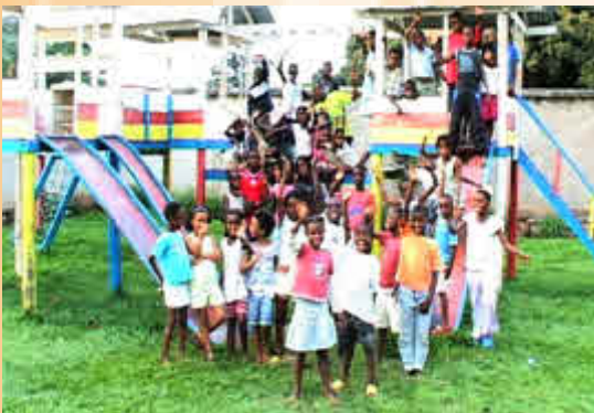
Most of the 38 children sponsored through CHI at the CRIB Orphans centre in Bujumbura