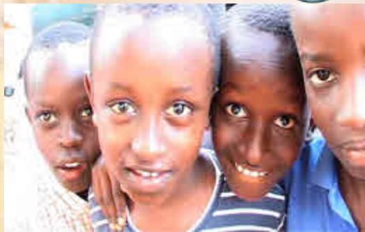
Children pushing forward to see the "Bazungu" visitors