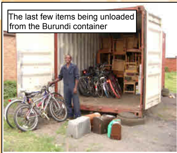
The last few items being unloaded from the Burundi container