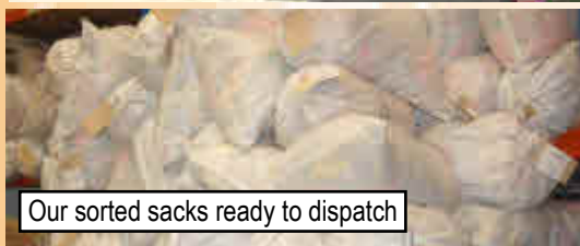
Our sorted sacks ready to dispatch