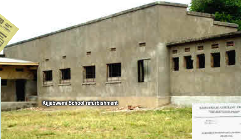
Kijjabwemi School refurbishment