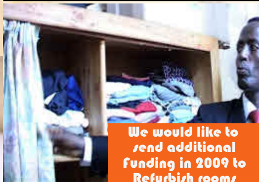
We would like to send additional funding in 2009 to Refurbish rooms and equip the "shop"